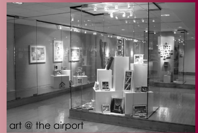
art @ the airport

Non-Profit Organization US POSTAGE PAID Rock Island, IL Permit No. 161